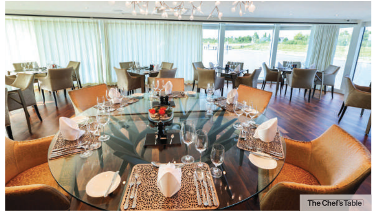
The Chef's Table